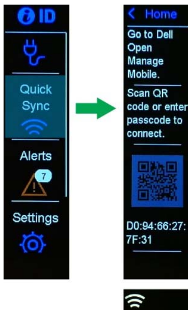
Figure 4 QuickSync broadcasting BLE endpoint

If the Management Module is configured with the default factory password for the admin login then a QR code is displayed on the LCD. (Only shown if the Management Module login credentials are configured with the default factory password, when password has been changed from default NO QR Code is displayed). When user presses or touches the QuickSync icon on the LCD panel it navigates to the QR code screen and Wi-Fi LED which is turned on to indicate that QuickSync 2 hardware is broadcasting its BLE end point. Figure 4 shows the QR code menu with Wi-Fi LED turned on.