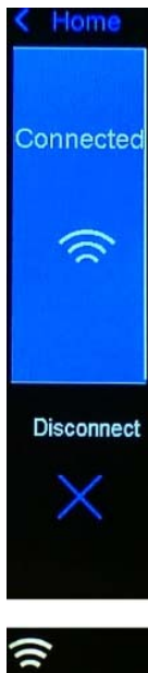
Figure 5 QuickSync successful connection

connection is initiated or when Chassis information is accessed from OMM application. OpenManage Mobile application details are outside the scope of this whitepaper. Figure 5 shows successful connection of QuickSync 2 hardware with OpenManage Mobile.