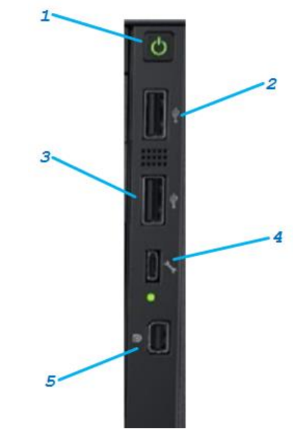
Figure 2 – Right Control Panel

The power button on the right control panel provides chassis power status and chassis power control. When the LED of the power button is lit green, the chassis power state is ON. If not lit, the state is OFF.