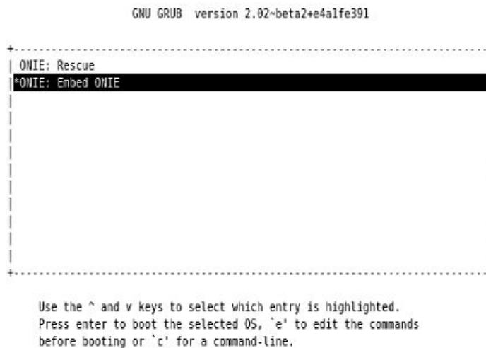
Figure 3. Embed ONIE menu

After exiting the BIOS Boot menu, the system boots with the ONIE USB and presents the following menu: