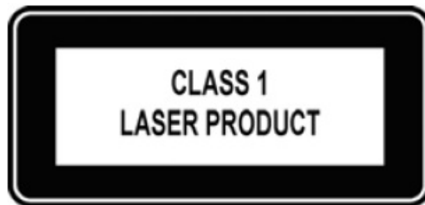
Figure 1. Class 1 laser product tag

NOTE: This equipment contains optical transceivers, which comply with the limits of Class 1 laser radiation.