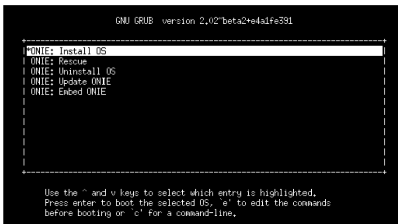
Figure 3. ONIE install menu

After the Embed-ONIE installation completes, the system bootups and presents the ONIE menu.