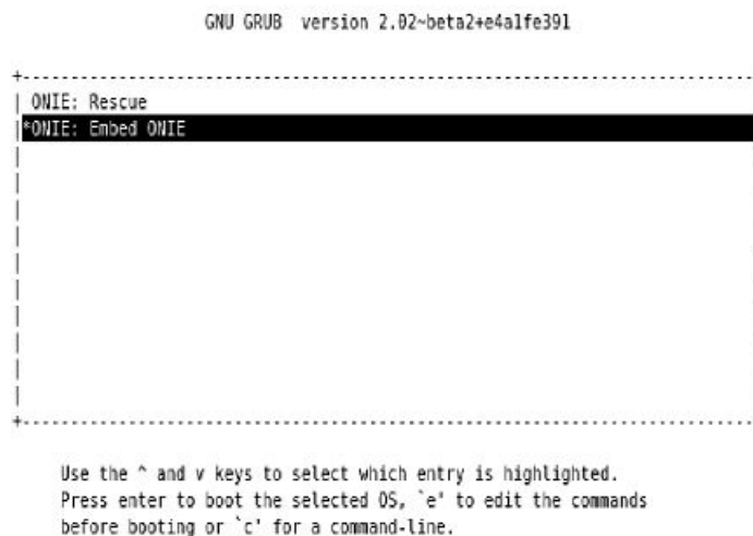
Figure 2. Embed ONIE menu

After the system exits the BIOS Boot menu, the system boots with the ONIE USB and presents the following menu: