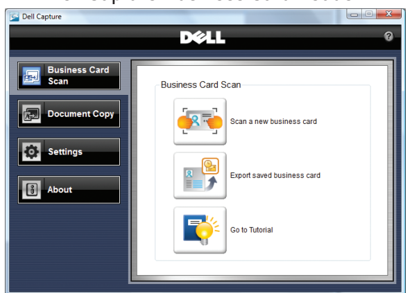
Dell Capture Document Scanner